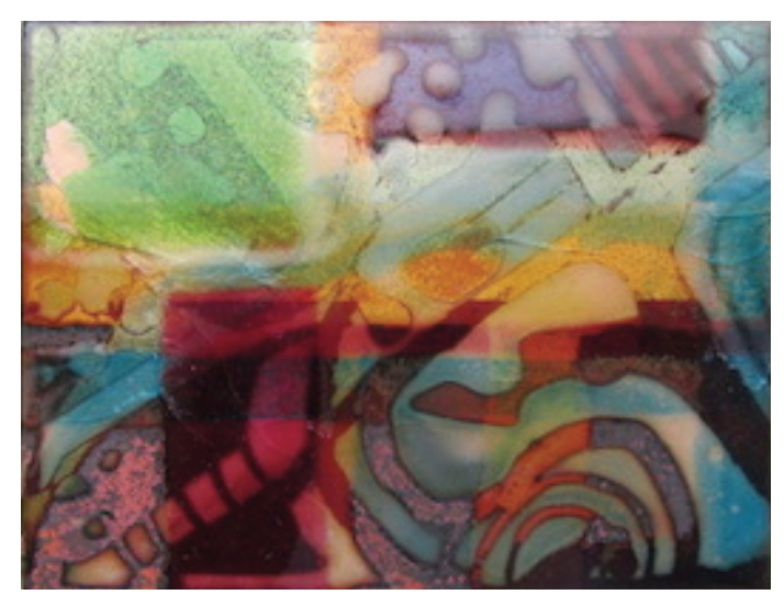
Project (3) Liquid Enamels, Stencil and Copper Oxide

Project (3) Liquid Enamels, Stencil and Copper Oxide. The idea of this project is to use the 'ways of working' from the first two projects, adding liquid enamels and stencil as further 'ways of working' to develop line, texture, spaces, contrasts etc., on a 3 x 4 inch copper rectangle. 'Ways of working' 'tools' will be used side by side and/or one on top of the other, in a gradual build up of imagery, composition, line, texture, and spaces. We will leave some areas to stay very light in color, light spaces like 2110 fully fired. Use pickle (Sparex #2) to remove copper oxide from some areas. The collective/cummulative result is unlike any other pursuit.