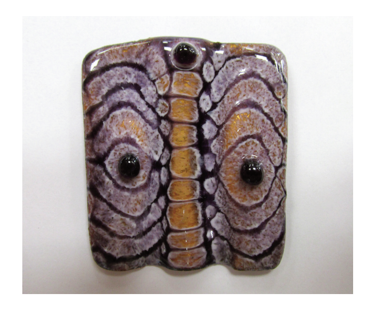
Project (2) - Separation Enamel Technique Custom shaped copper pendant using separation enamel technique. Layered opaque and transparent enamels on copper, with separation pattern, firing instruction. Create marble-like color/textures with separation enamel.