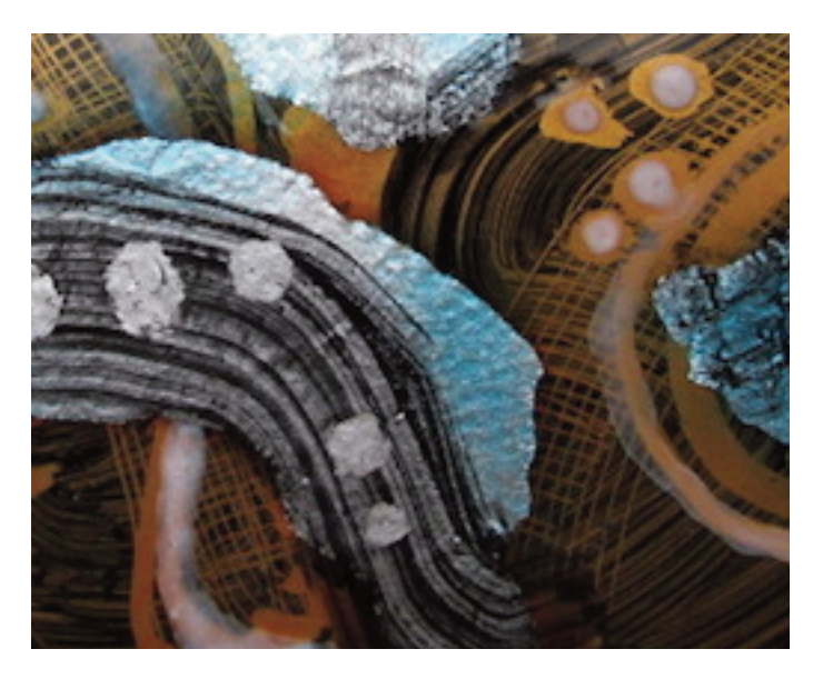
Project (3) - P-3 Black Oxide Technique Custom shaped copper pendant with sponge printed P-3 black oxide, covered with transparent enamel. Black Oxide sponged onto copper and sgraffitoed under transparents makes for unusual patterns, color and texture.