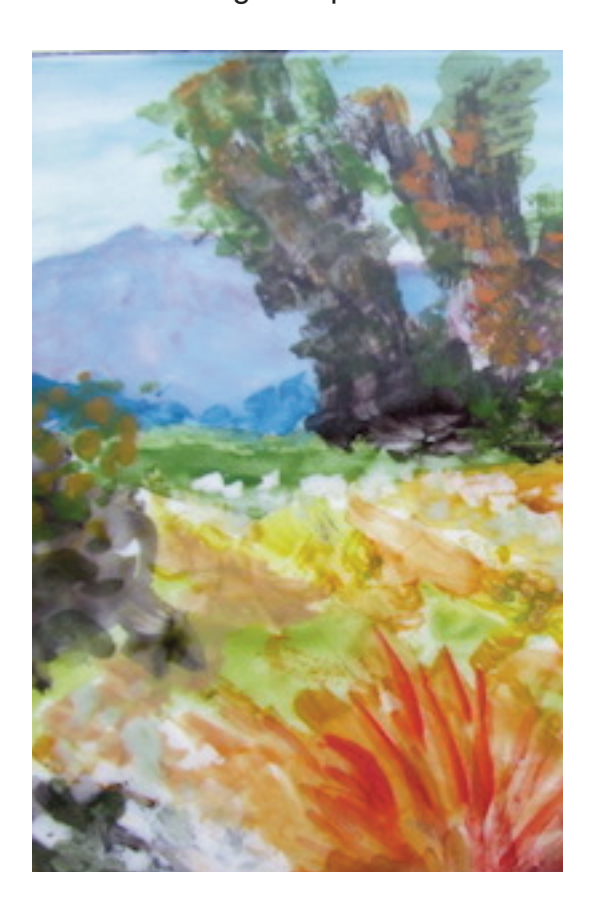
Project (3) is a 4" x 6", 18-gauge steel plaque that will be used to work on an image that you provide. Your image's primary outlines will be permanently transferred to the enameled steel

Project (2) is a 3" x 3" or 4" x 4" 18-gauge enamel on steel plaque using ceramic pigments to achieve shapes, texture, line and colors to create abstract or real imagery. Layers are built up one over the other with clear transparent enamel used in thin layers between coats to create a feeling of depth.