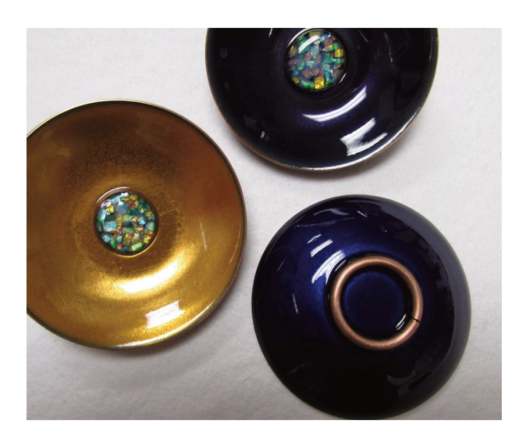
Project (4) Gold and Silver Foil on 3-D Bowl Copper bowl coated with direct for copper transparent enamel, copper ring foot to eliminate stilt marks, copper cloisonne circle boundary on front, gold and silver foil application, transparent color and lump enamel decoration. Learn to achieve a consistent and uniform direct on copper transparent color application on a bowl.