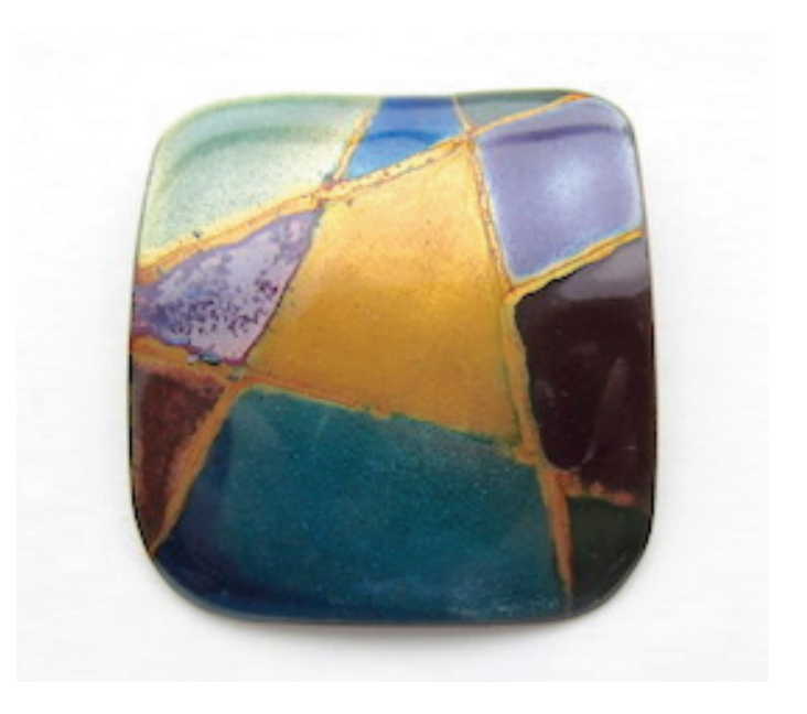
Project (1) - Discover direct for copper transparents and wet inlay technique Custom shaped pendant using sifting, wet inlay, transparent and opalescent enamels, copper oxide and firing instruction. Find out which transparent colors work well direct on copper. Discover what copper oxide looks like as a decorating material. Learn the secrets to successful wet inlay.